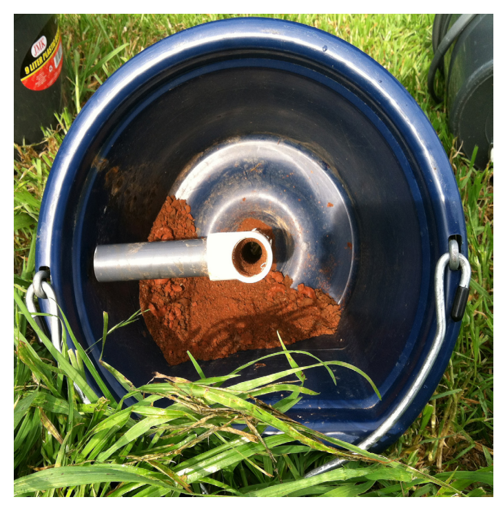
Figure 9. Image showing the soil buildup inside the pipe in the client's tee-bar style unit, using a 5/8" Long Ship Auger drill bit and 3/4" Schedule 80 PVC pipe. Excessive wall-to-bit clearance was a factor.

The long exit hole unit, using 3/4" Schedule 40 PVC pipe and a 3/4" Ship Auger drill bit, worked satisfactorily during the test with very little torque induced (holding the edge of the bucket lightly was sufficient to prevent spin). Soil did not appear to build up inside the tube (Figure 12), partially due to the ease of soil exit with the larger hole and partially due to the closer clearance between the 3/4" drill bit and the PVC pipe wall. Soil may build up over time based on client observations, but in the approximately 20-core test there was little noticeable soil buildup.