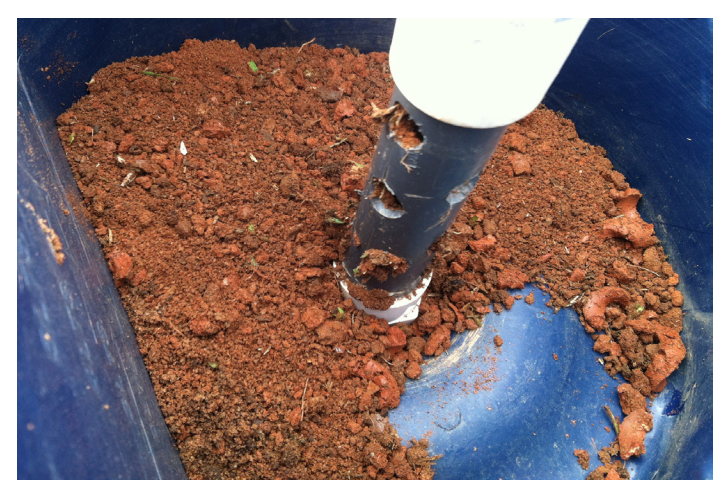
Figure 10. Even with multiple soil outlet holes, this design showed plugging issues in the 3/4" Schedule 80 PVC pipe, which possibly also contributed to the soil layer deposit in the pipe.

Based on the field test the long exit hole design is recommended. Clients with dry or lighter soils may find the single exit hole design satisfactory, but if not another hole can easily be added to the existing unit and the material removed between the two holes.