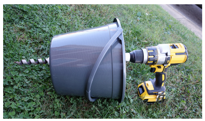
Figure 4. Completed unit showing the drill bit extending 4 inches past the male adapter after the drill chuck comes in contact with the pvc pipe.