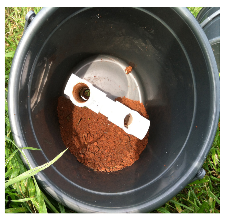
Figure 12. Both units were used to sample an equivalent number of soil cores. This design not only showed no torque force on the pipe, but also showed little sign of soil buildup inside the pipe.

If all the soil sampling on your farm will be in pastures, hay fields, and no-till fields, a single pipe and male adapter assembly (with a cross pipe in case of twisting) placed in the pail to allow a 4 inch sampling depth will be sufficient. If, however, your farm also has tilled fields, adding another pipe / male adapter unit that allows the drill bit to penetrate to a 6 to 8 inch depth in the same pail is a simple process. Be sure to mark the depth of sampling on each pipe with a permanent marker in this case to prevent confusion.