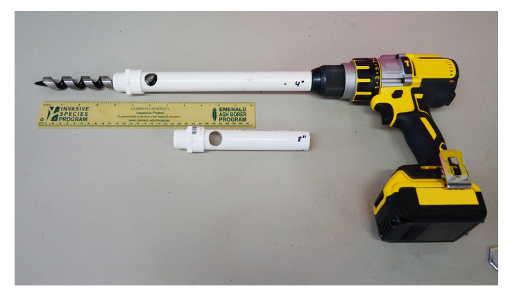
Figure 2. Completed PVC pipes used in the first design to limit sampling depth (one 4" depth; one 8" depth). Note the single hole which will allow soil to exit into the pail when installed.

The simplest way to determine the length of PVC piping required is to first slide a length of it firmly into a 3/4 inch Schedule 40 PVC male adapter (this may be simply friction-fit together instead of glued, since there will be no pressure and little force on the unit). Next, attach the Long Ship Auger to the drill to be used, and place the unit