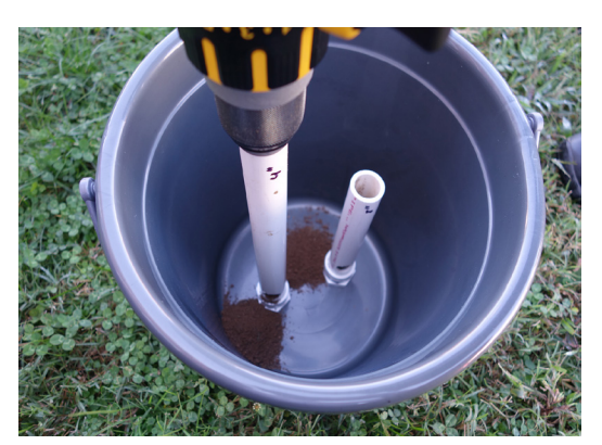
Figure 5. The completed original single hole unit in operation, showing dry soil exiting the pipe from the holes on both sides of the pvc pipe.

The 3/4" holes in this design provided an easy exit point for dry soils. However, several clients noted that if heavier soils with some moisture in them – not mud, but "plow moisture" soils – were sampled, repeated sampling could leave a thin layer of heavy soil into the PVC pipe and cause a rotation stress or torque on the pipe. This caused the PVC pipe to spin while sampling. The clients addressed the issue by gluing a cross-bar or tee-bar arrangement to the soil sampling device that could be held, which kept the PVC pipe from rotating (see Figure 6).