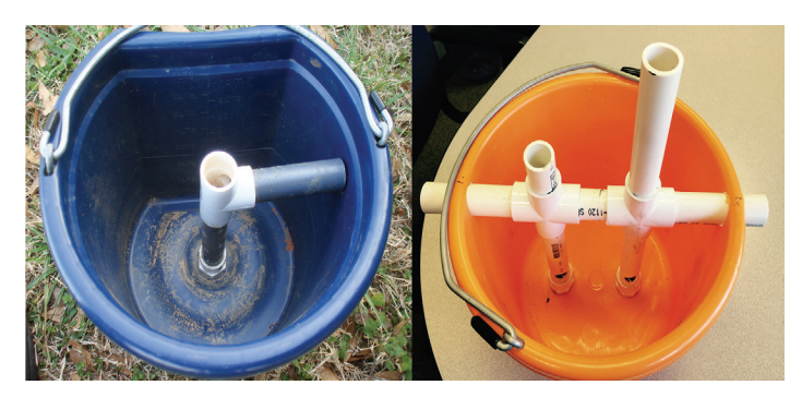
Figure 6. Client modifications to prevent PVC pipe from spinning when sampling moist soils. (Left) The side handle is held while sampling. This design has multiple soil exit holes. (Right) Another design with two sampling depths and pipe through the pail sides for stability. This design has single soil exit holes.

The 3/4" holes in this design provided an easy exit point for dry soils. However, several clients noted that if heavier soils with some moisture in them – not mud, but "plow moisture" soils – were sampled, repeated sampling could leave a thin layer of heavy soil into the PVC pipe and cause a rotation stress or torque on the pipe. This caused the PVC pipe to spin while sampling. The clients addressed the issue by gluing a cross-bar or tee-bar arrangement to the soil sampling device that could be held, which kept the PVC pipe from rotating (see Figure 6).