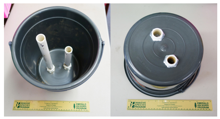
Figure 3. Completed Modified Sweatless Soil Sampler with single exit hole. This model has two sampling tubes installed, one for a 4 inch sampling depth, and another for an 8 inch sampling depth. Note the conduit nuts on the bottom of the pail holding the male adapters in place.

The soil exit holes can be made by carefully drilling a 3/4" hole through the PVC pipe just above the male adapter. Be sure to properly secure the pipe unit in a vise before drilling to prevent injury.