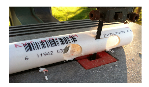
Figure 7. Two 3/4" holes were drilled in the pipe with a hole saw. A band saw was then used to remove material between the holes drilled to provide a larger soil exit point.

An alternative design to help alleviate this torque is to make the soil exit hole larger. The 3/4" hole saw was used to drill two holes completely through the PVC pipe approximately 3 inches apart on center, and then a band saw was used to remove the side of the PVC pipe between the holes (Figure 7). (A jig saw or coping saw could be used if the pipe is secured properly in a vise.) This creates a 3 inch long hole on each side of the PVC pipe, allowing a much larger area for soil to exit the pipe and leaving less pipe wall for the soil to compact against to cause torque. PVC crosses were used in the updated design like the ones in the client modifications in case there was any torque on the pipe with moist soils (Figure 8).