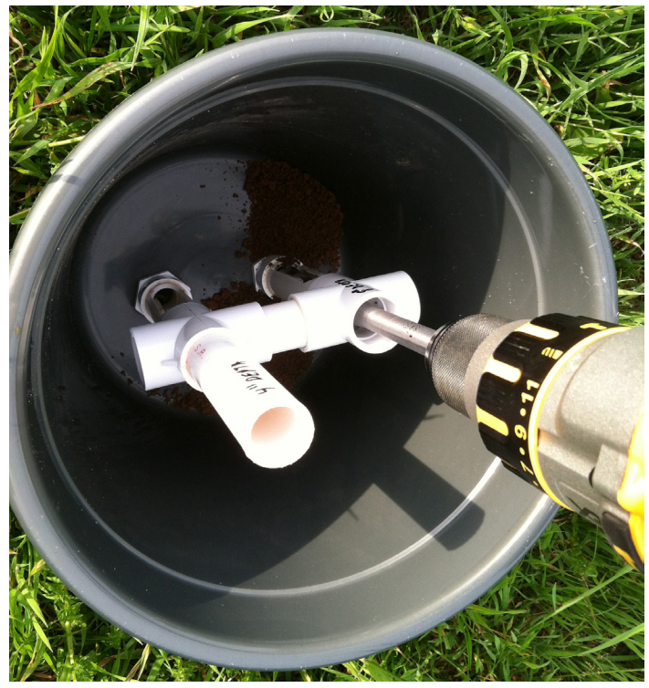
Figure 11. The long hole exit unit in use. This unit has two pipes to allow both 4 inch and 8 inch deep soil sampling. Note the soil exit holes are facing the pail sides, not the adjacent pipe, to prevent soil loss through the pipe not being used.

If all the soil sampling on your farm will be in pastures, hay fields, and no-till fields, a single pipe and male adapter assembly (with a cross pipe in case of twisting) placed in the pail to allow a 4 inch sampling depth will be sufficient. If, however, your farm also has tilled fields, adding another pipe / male adapter unit that allows the drill bit to penetrate to a 6 to 8 inch depth in the same pail is a simple process. Be sure to mark the depth of sampling on each pipe with a permanent marker in this case to prevent confusion.