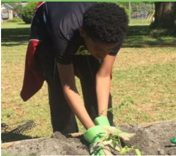
Koinonia Community Garden