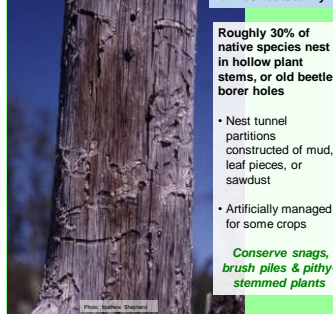
Tunnel/wood/cavity nesting solitary bees

Nest tunnel partitions constructed of mud,