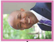
Overture E. Walker District 8