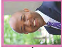
Overture E. Walker District 8