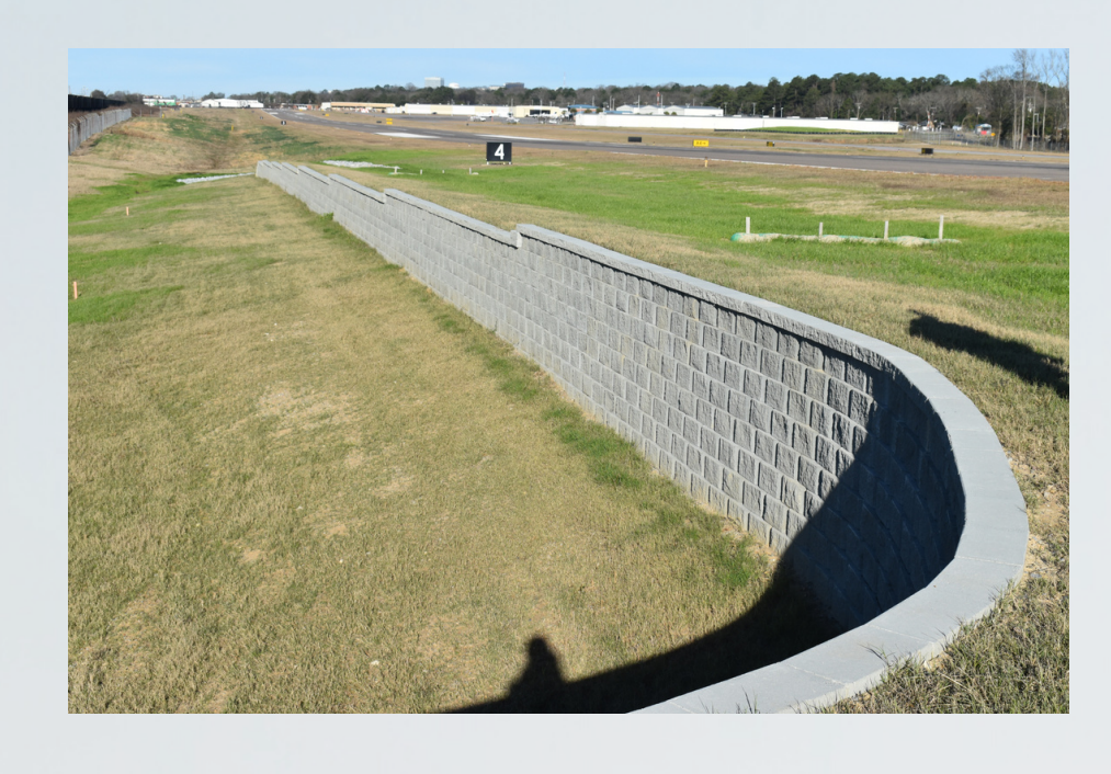
FUNDING AIP 024-2018 (Design) AIP 026-2020 (Construction)