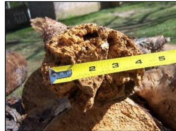
How to measure a limb diameter.

Please do not place limbs, branches or leaves in creeks, storm drains or drainage ditches. All debris must be on the property-side of the curb and not in the street. You could be fined up to $1,092.50 for placing yard waste in the street. These materials obstruct drainage flow, which increases the potential for flooding and mosquito problems.