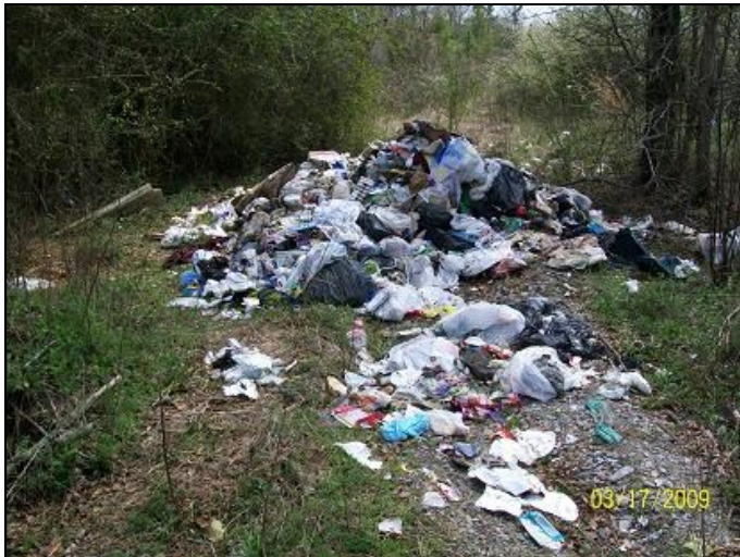
Illegal Disposal Pile