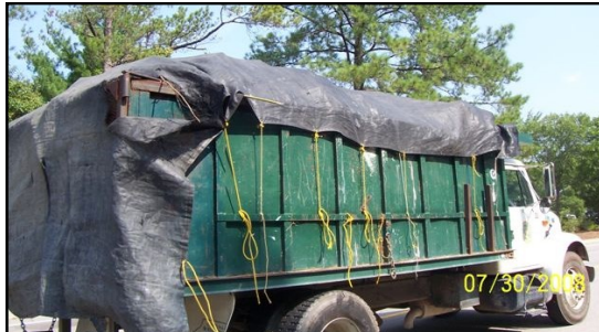
Proper way to secure load

(b) It shall be a violation of this article for any person not authorized by the County to collect and haul any refuse other than that arising from his own accumulation within any area of the county in which refuse collection service is maintained by the county.