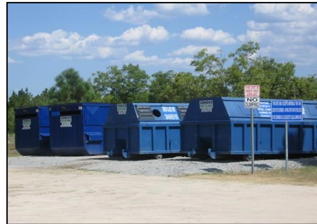
Clemson Road Drop Off Site

Waste Management Landfill 1047 Highway Church Road Elgin, South Carolina Telephone (803) 744-3345