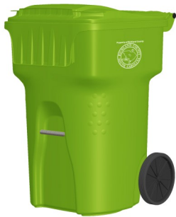
New Recycling Carts to replace smaller Red Bins