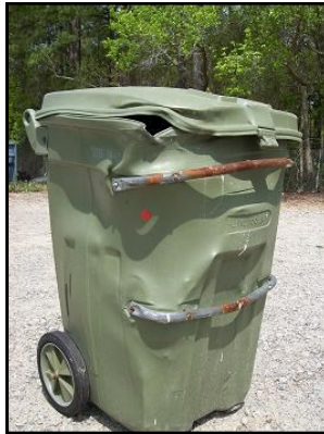
Damaged roll cart