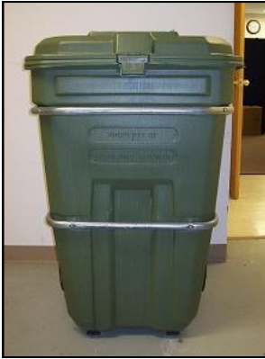
Serviceable roll cart

CARTS WILL NOT BE EXCHANGED BECAUSE THEY ARE DIRTY.